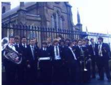
1608 Choir Armagh - 5th March 2008

music, athletics, Tag rugby, swimming, hockey and golf. In March – within eight days – we celebrated the Royal Schools by a special service in Armagh cathedral with Lord Eames as preacher. We were honoured by the presence of the Duke of Gloucester and the President of Ireland who read lessons together with the heads of the main churches and many other luminaries. It was a fitting tribute to our schools.